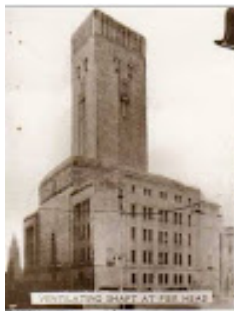
VENTILATING SHAFT AT 222 FEET HIGH