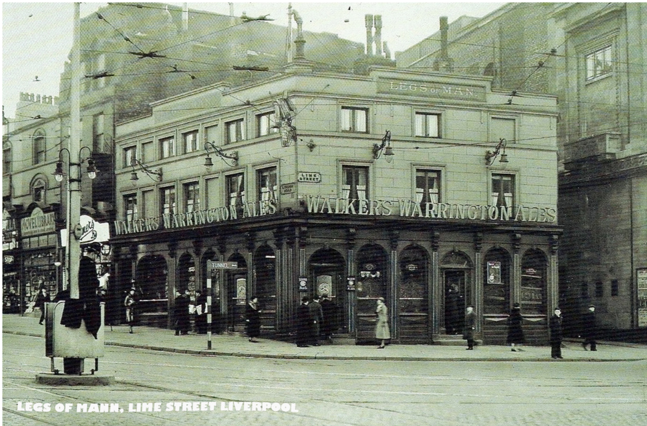
LEGS OF MANN, LIME STREET LIVERPOOL