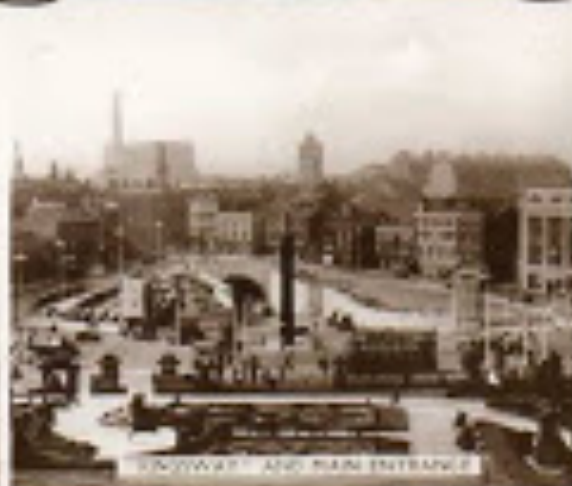
ROADWAY AND MAIN ENTRANCE