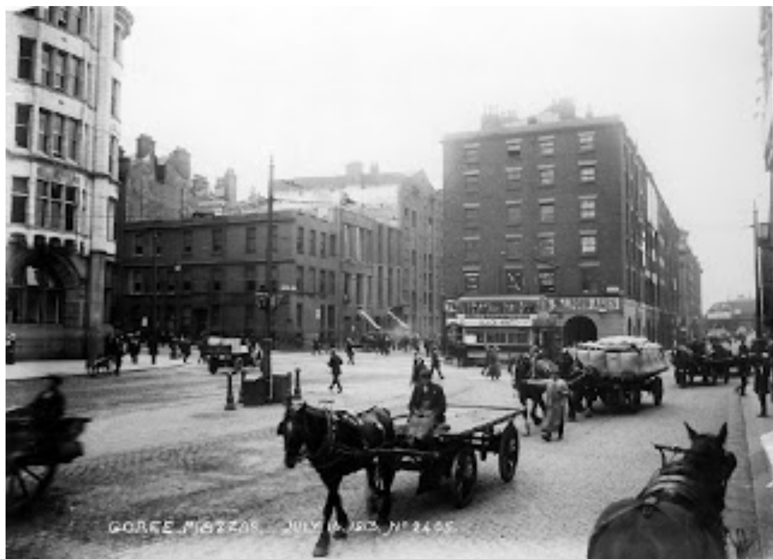
GORKE M187208 JULY 1883, N° 24 05