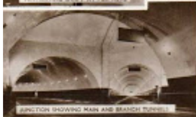
JUNCTION SHOWING MAIN AND BRANCH TUNNELS