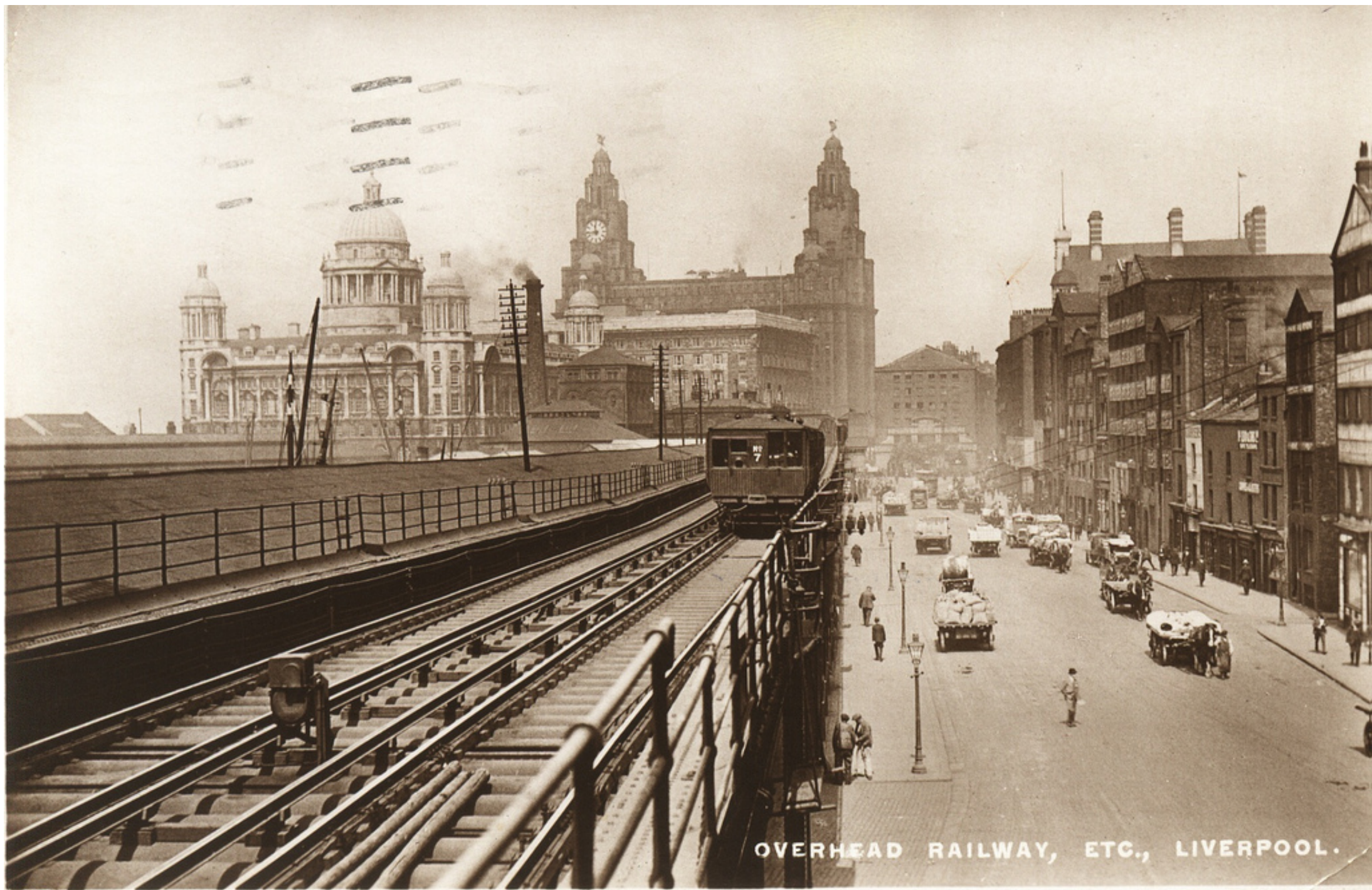
OVERHEAD RAILWAY, ETC., LIVERPOOL.