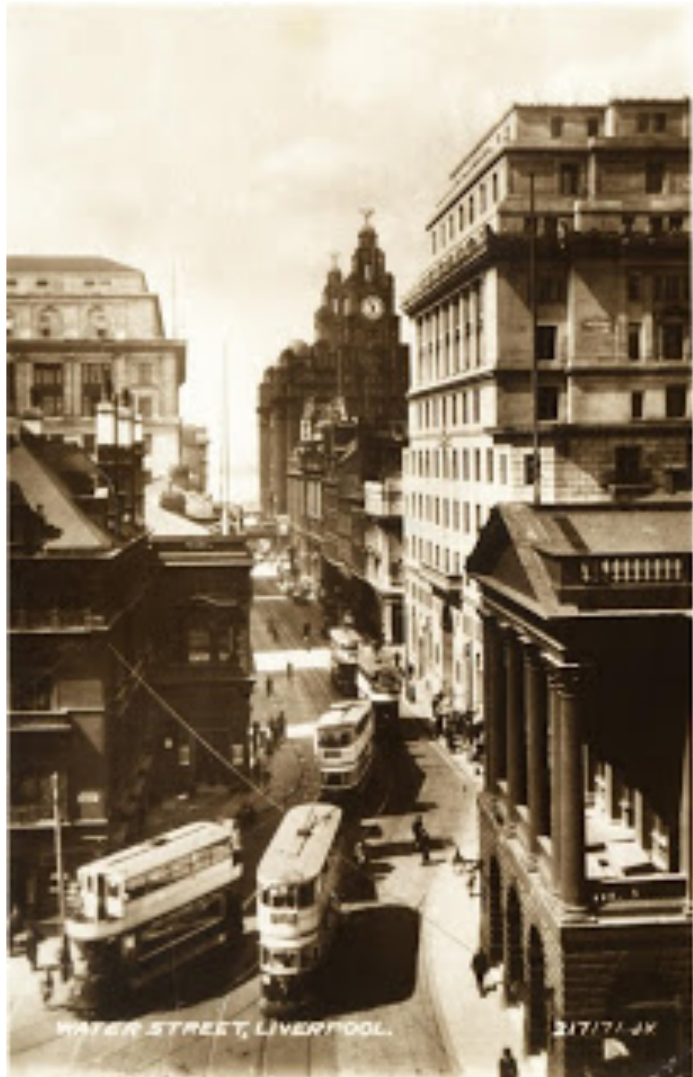
WATER STREET, LIVERPOOL.