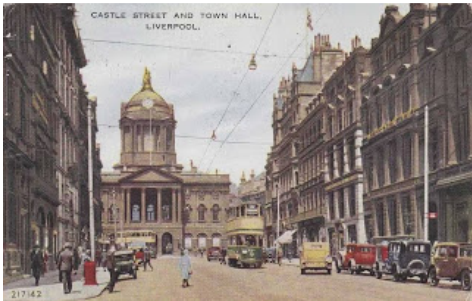
CASTLE STREET AND TOWN HALL, LIVERPOOL.