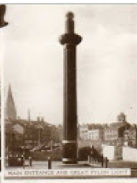
MAIN ENTRANCE AND GREAT PYLON 100 FT