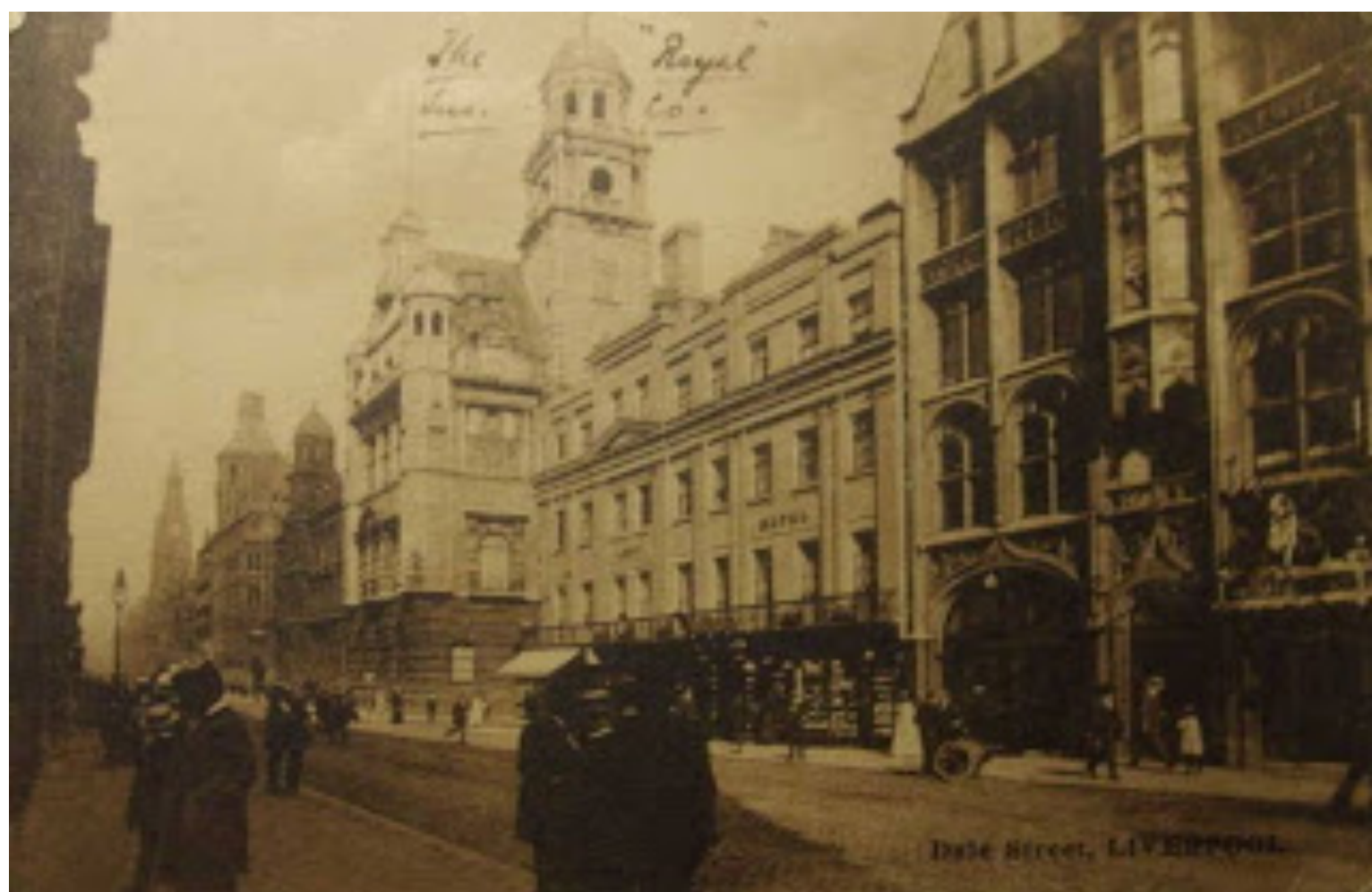
Dale Street, LIVERPOOL.