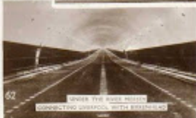
UNDER THE RIVER MERSEY CONNECTING LIVERPOOL WITH BIRKENHEAD

COMMENCED DECEMBER 1903 OPENED JULY 1904 BY HIS LATE MAJESTY KING GEORGE V. LENGTH FROM END TO END 2.11 MILES. TOTAL COST £1,277,800