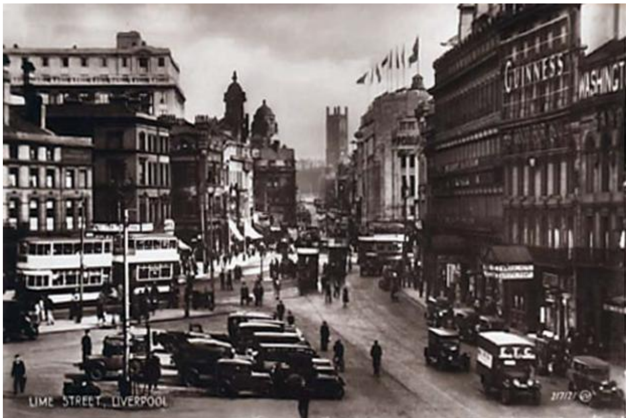
LIME STREET, LIVERPOOL