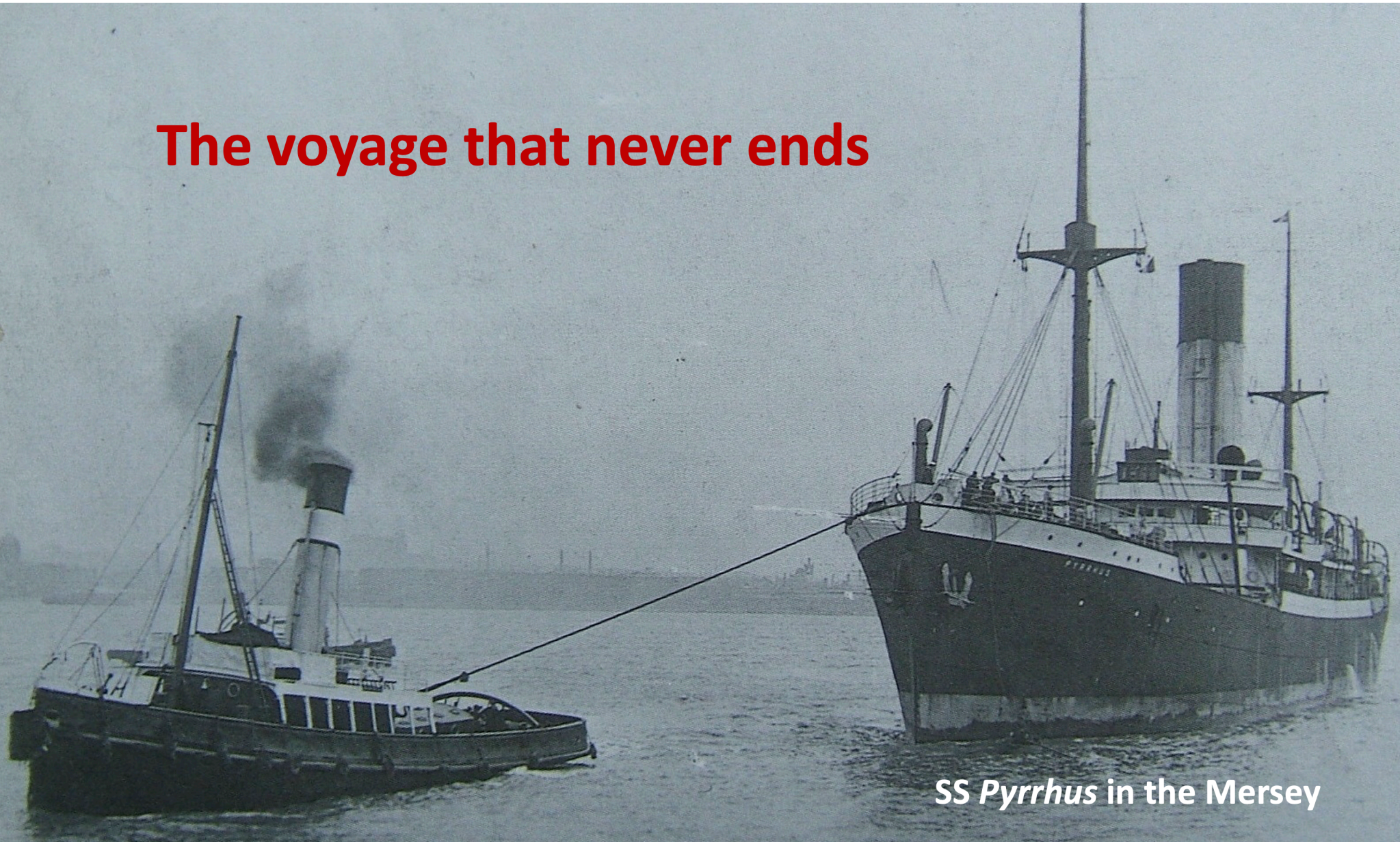
SS Pyrrhus in the Mersey