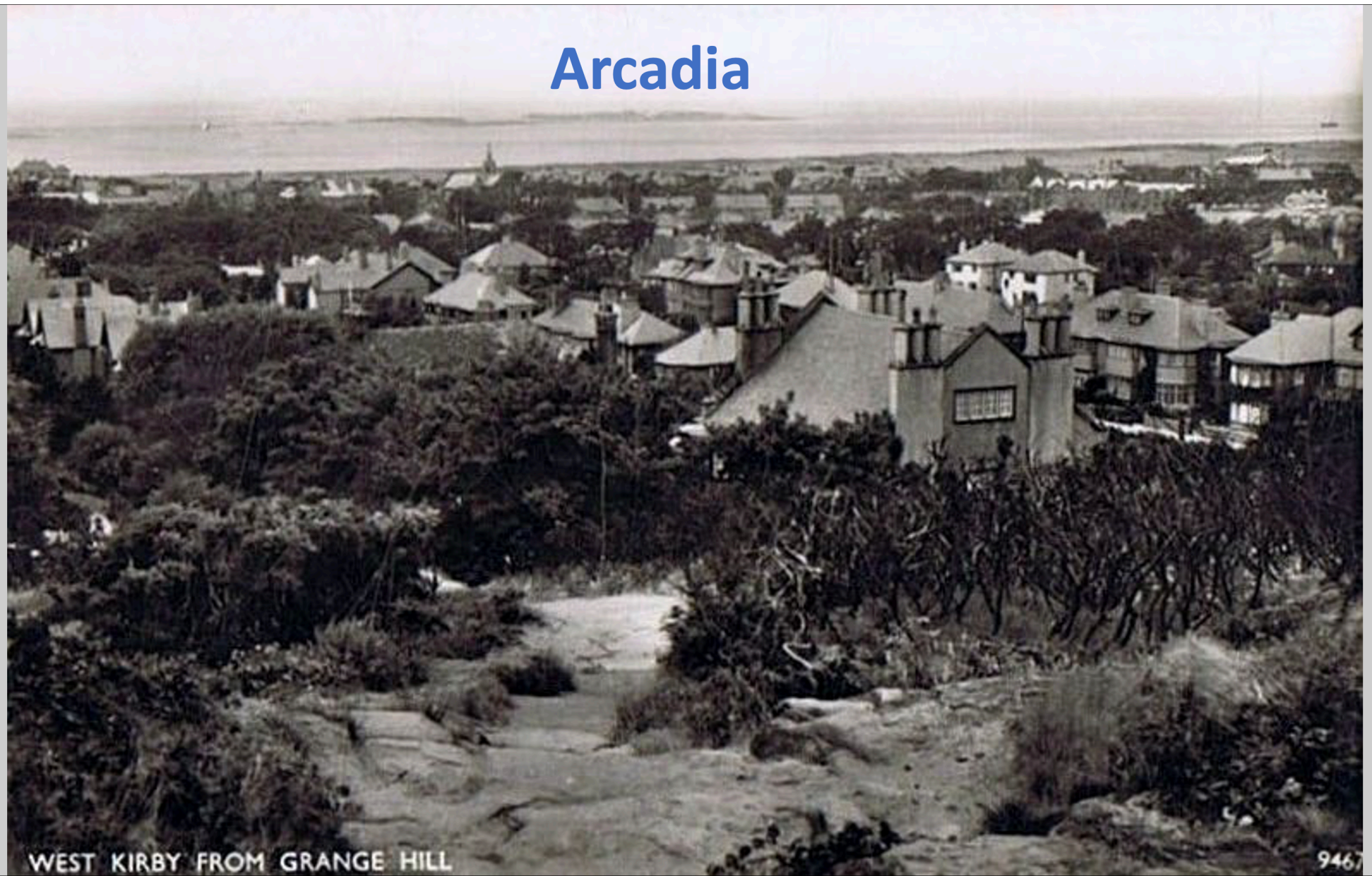
WEST KIRBY FROM GRANGE HILL