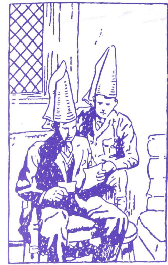
"I'M AFRAID IT'S GRIM NEWS, SANDY— THE VICE-CONSUL INTENDS TO BAN THE WEARING OF WIMPLES AFTER 7-15 P.M."

Paintings, drawings and prints completed over the past two years during the artist's fellowship in the Fine Art Department of Nottingham University.