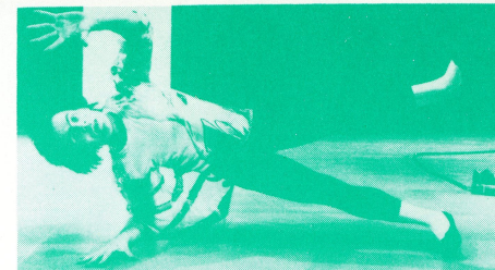
Mantis Dance Company