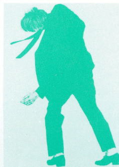
Robert Longo: Untitled