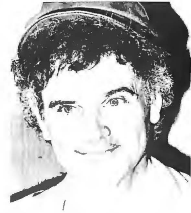
Peter Maxwell Davies.