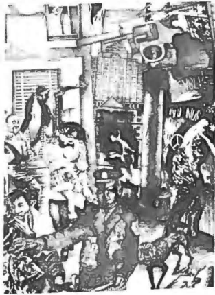
Living on the Front Line by Anthony Davies.

Bevan's large, emblematic paintings, usually of single figures depicted in some symbolic gesture such as head bowed or hands clasped in despair, convey the artist's interest 'in showing an individual reflecting the state of society that conditions our present'. Horrigan's sense of injustice, conveyed in previous work that dealt with specific issues like unemployment or the exploitation of Asian workers in the sweated industry of London's East End clothing factories, is continued in a new installation, centred on a series of judges wigs modelled in clay, which is concerned with matters being settled in a Court of Law at the same time 'as conventions and normal methods of arbitration are deliberately ignored or eroded'.