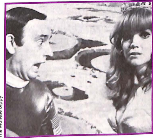
The Maltese Bippy

Rowan and Martin's Laugh In reached the big screen in what is one of the craziest movies every made. Never before seen on Merseyside (or anywhere else we know of).