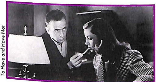
To Have and Have Not

Upward mobility is the name of the game, and the cream of our comedy actors play it to the hilt. Seven householders (variously symbolising the deadly sins) are on the move, each mounting a rung of the social ladder in a way only possible in the finely stratified atmosphere of Britain.