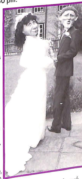
Trestle Theatre Company

Trestle bring their new show to the Bluecoat as part of our Summer Dance & Mime festival. Passion, intrigue, love, lust... 'A Slight Hitch' has it all. Impending chaos stalks the nuptials of a naïve young couple embarking on a lifetime of wedded bliss. Back home their families try desperately to smooth differences and resentments are just below the surface. This hilarious new piece from Trestle combines music and mask to great effect, creating a tapestry of colourful characters that have become their hallmark, with, of course, the emphasis strongly on entertainment. "... a group who excel in comic invention and mask making"