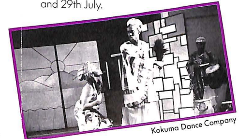
Kokuma Dance Company