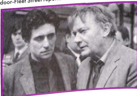
Defence of the Realm

A sharp-edged, paranoid thriller that will surely feed contemporary fears and anxieties of government conspiracies. A parliamentary sex-scandal story is just the first worm in a whole can-ful opened by a foot-in-the-door-Fleet Street reporter.