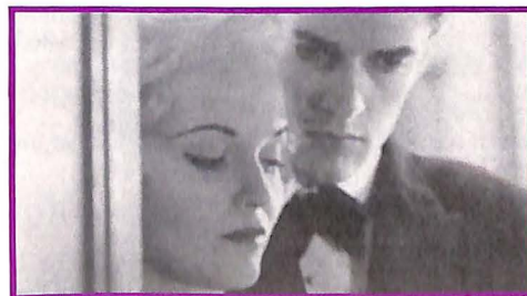
Dance with a Stranger