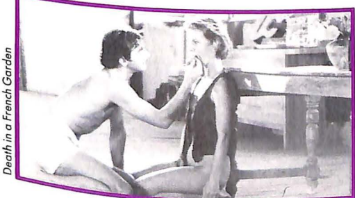
Death in a French Garden

The most successful film of last year in France. An erotic, semi-surreal thriller steeped in black humour that should finally alter the fact that Deville's films have rarely been seen in Britain. An intriguing, very sophisticated picture. Francophiles will love it.