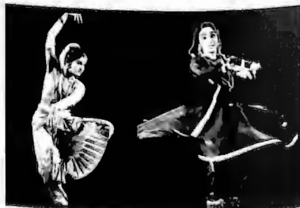
Sanskritic Arts Festival of India

This event is a co-production with Milap an Asian cultural group.