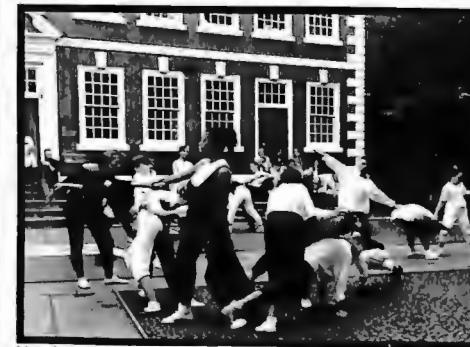
Youth Dance Project '85