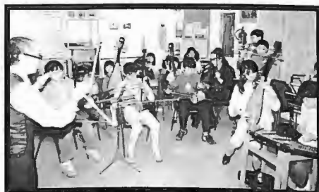
Pagoda Chinese Youth Orchestra

Thursday 6, Friday 7 August at 7.30pm. Evening of Chinese Dance Music