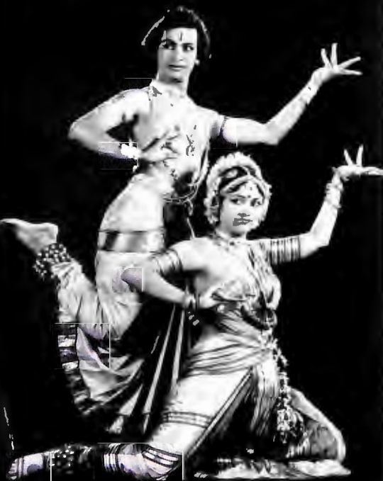
Sanskritic Arts Festival of India