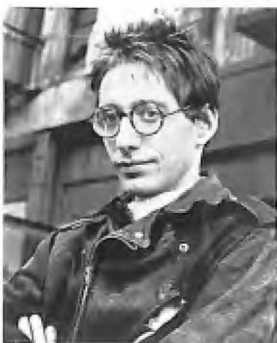
John Zorn