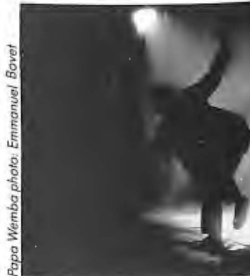
Papa Wemba

Our popular Children's Art Week takes place during the half-term holiday, 24-28 October.