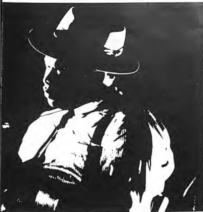
Bird: Forest Whitaker (Charlie Parker)