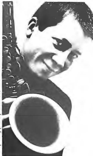
Andy Sheppard