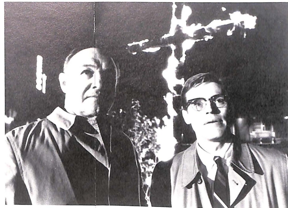
Mississippi Burning

Friday 9 February 7.00pm only STEREO/CRIMES OF THE FUTURE/RAMSEY CAMPBELL LECTURE Director: David Cronenberg Canada 1969/70