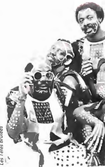
Les Têtes Brulées

Thursday 1 November MEMORIES FROM THE MIDDLE KINGDOM £3.50/(£2.50)