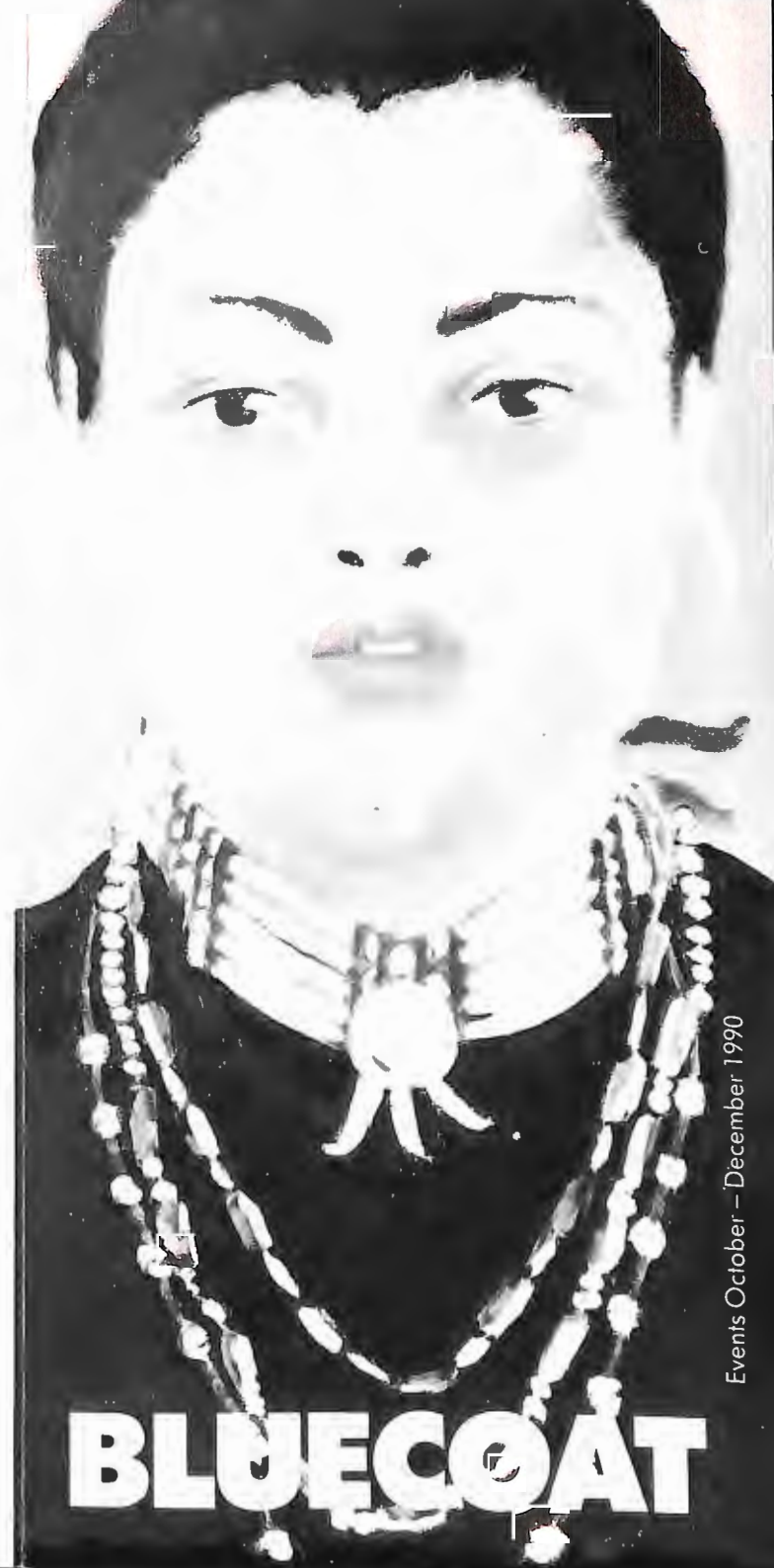
Events October – December 1990