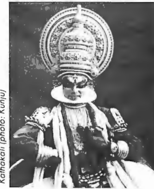
Kathakali

Saturday 13 October 8pm *KALA CHETHANA KATHAKALI TROUPE Kathakali Dance Drama In this highly visual spectacle from Kerala, South India, actors/dancers wear magnificent decorated costumes, including carved wooden headdresses and elaborate make up. Accompanied by musicians and singers, the actors represent mythological characters of gods, humans and demons as they perform stories from the great Indian epics – The Ramayans and The Mahabharata . The Kala Chethona troupe all trained at the Keralo Kalamondalam, the main training centre for Kathakali. They have toured extensively in Europe and India and are recognised as leading exponents of this 400 year old tradition. £4/(£3) South Indian buffet available from 7pm. £4. Must be booked by 10 October.