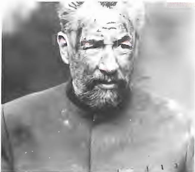
Life and Nothing But

Monday/Tuesday/Wednesday 26/27/28 November DO THE RIGHT THING Director: Spike Lee U.S.A. 1988