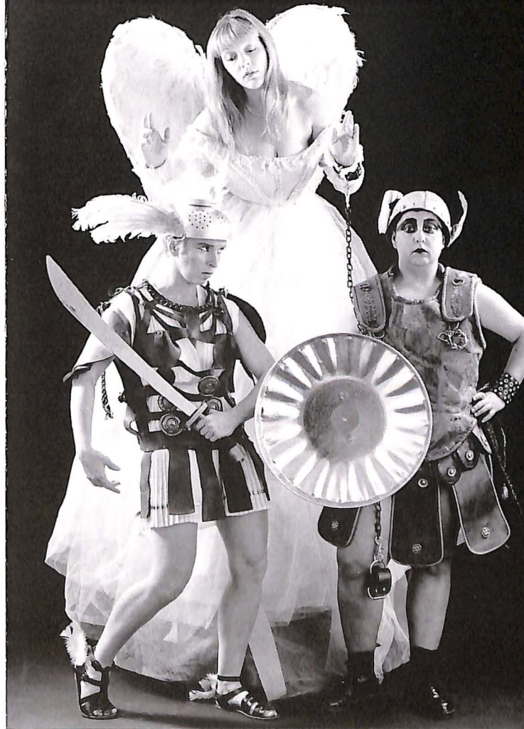
Ra-Ra Zoo

BLUECOAT ARTS CENTRE, SCHOOL LANE, LIVERPOOL L1 3BX