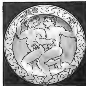
Martin Hearne ceramic plate

An exhibition of 150 plates by 50 British ceramicists.