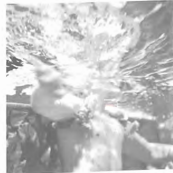
Hub Learning to Fly