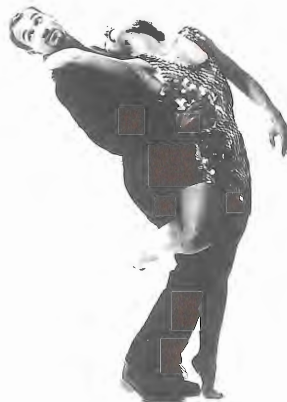
Motionhouse Geisha