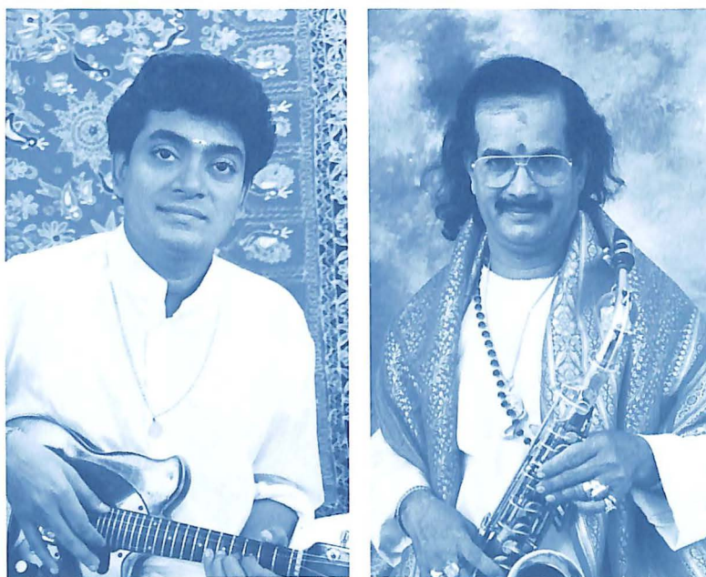
U. Srinivas & Kadri Gopalnath