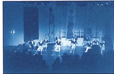
Full Circle Merseyside Dance Initiative community dance event (Concert Hall)