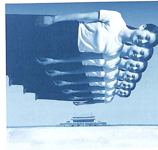
Chinese Takeaway Bi Ma Dance Company