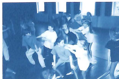
Children's Dance Week 1997 (Concert Hall)