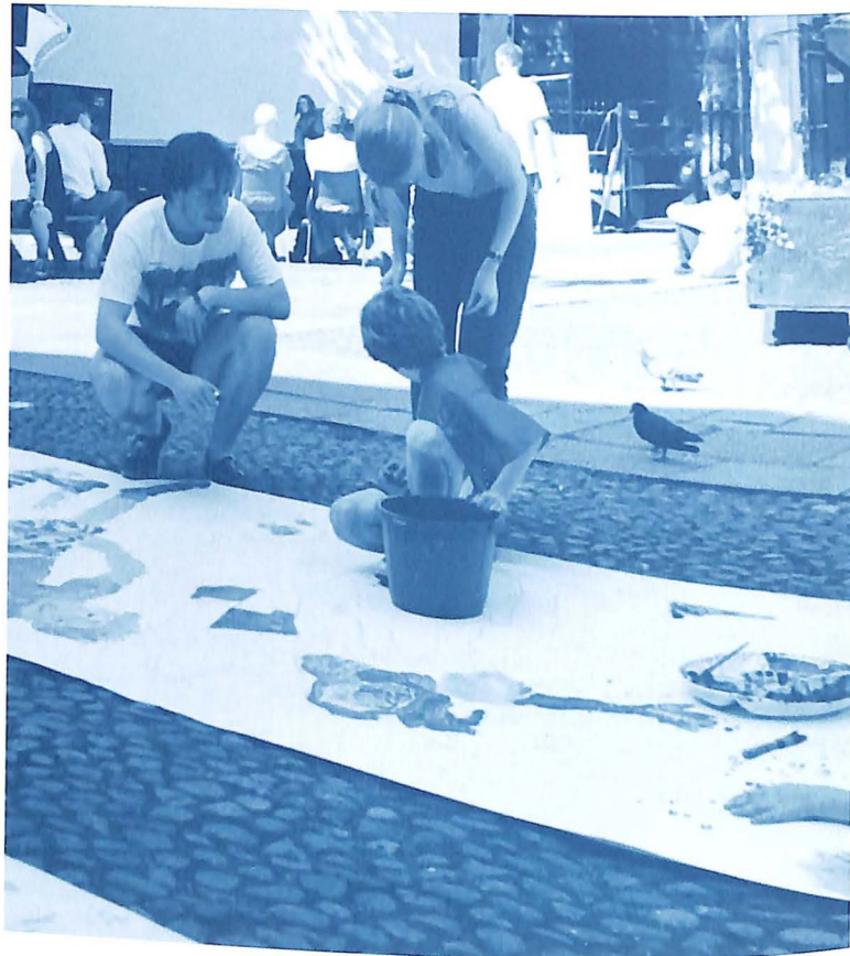
Children's Art Activities