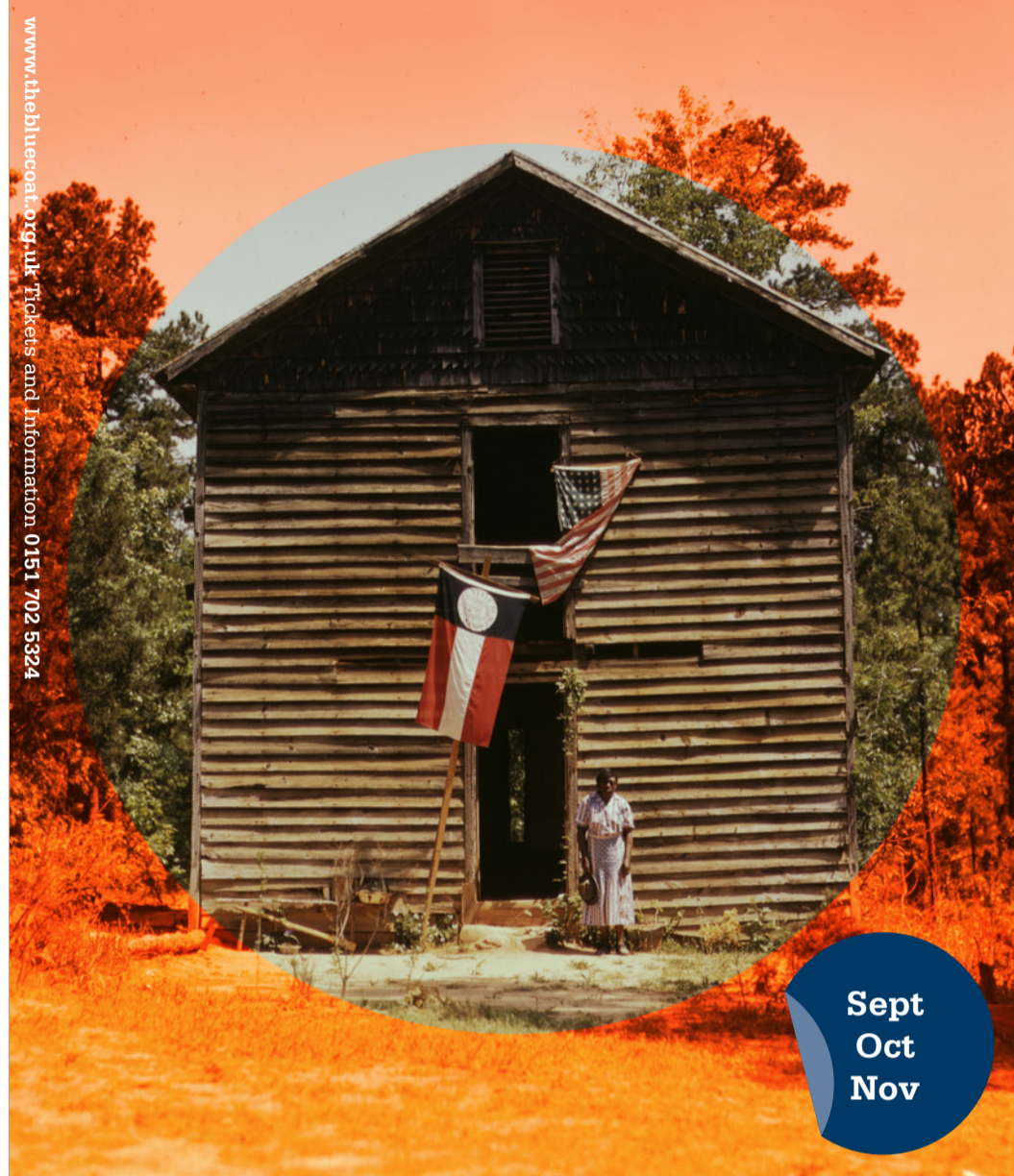
John Akomfrah: 'Told Mama', from 'Inhospitable Climes'.

www.thebluecoat.org.uk Tickets and Information 0151 702 5324