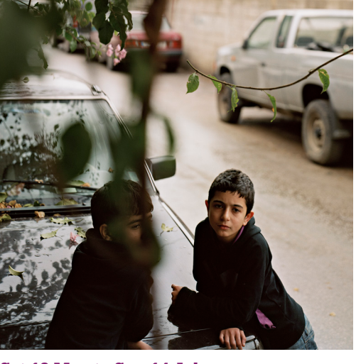
Sat 18 May to Sun 14 July daily 10am - 6pm. Free