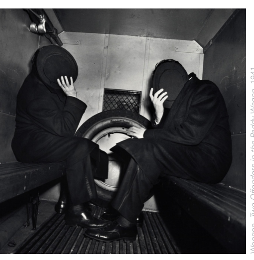
Sat 18 May to Sun 14 July daily 10am - 6pm. Free