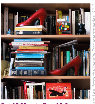
Sat 18 May to Sun 16 June daily 10am - 6pm. Free