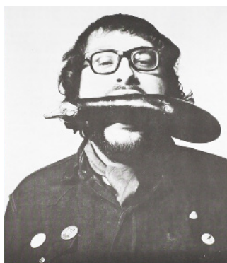
THE LIVERPOOL SCENE

Find out about the Bluecoat's transformation from charity school to contemporary arts centre on this weekend of guided tours, family activities, archive displays and talks. In 2017 the building will be 300 years old, and people who have Bluecoat stories of their own will be invited to connect with us. Part of Heritage Open Days: www.heritageopendays.org.uk Free. Book for the building tours