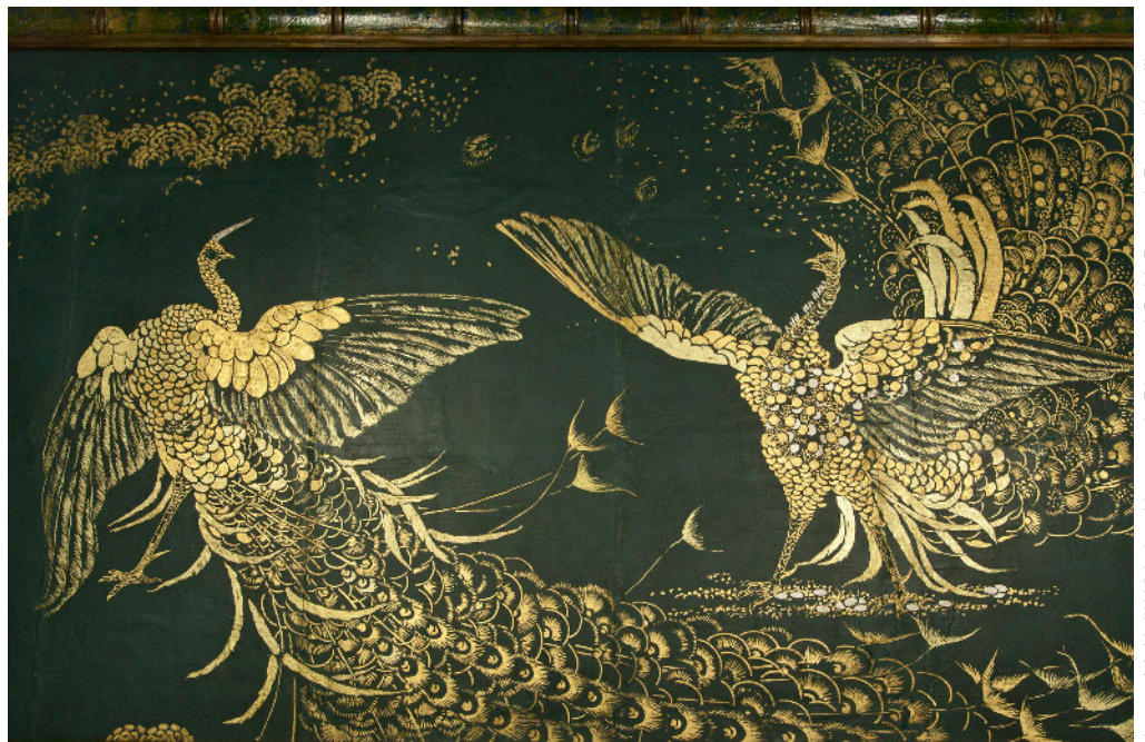
James McNeill Whistler, Harmony in Blue and Gold: Peacock Room (detail) , 1876-77. Freer Gallery of Art, Smithsonian Institution, Washington, D.C.