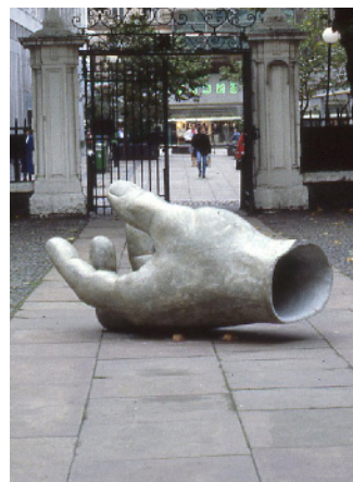
Vincent Woropay, Bluecoat courtyard sculpture, 1988.