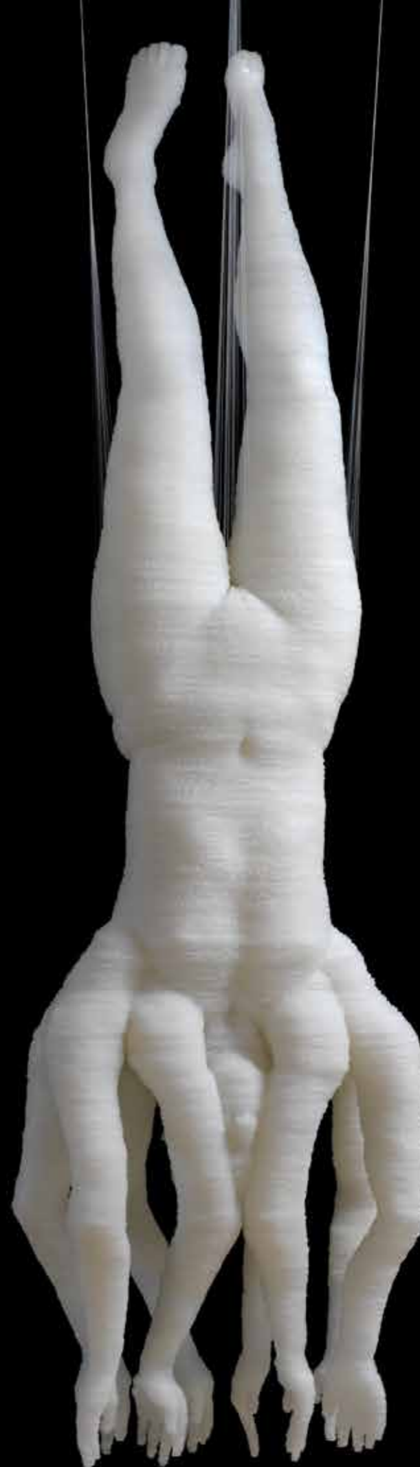
Marilène Oliver, Fallen Durga , 2010, Twin walled plastic, 220 x 80 x 45cm