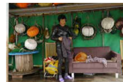
Mikhail Karikis SeaWomen , 2012. Courtesy the artist.