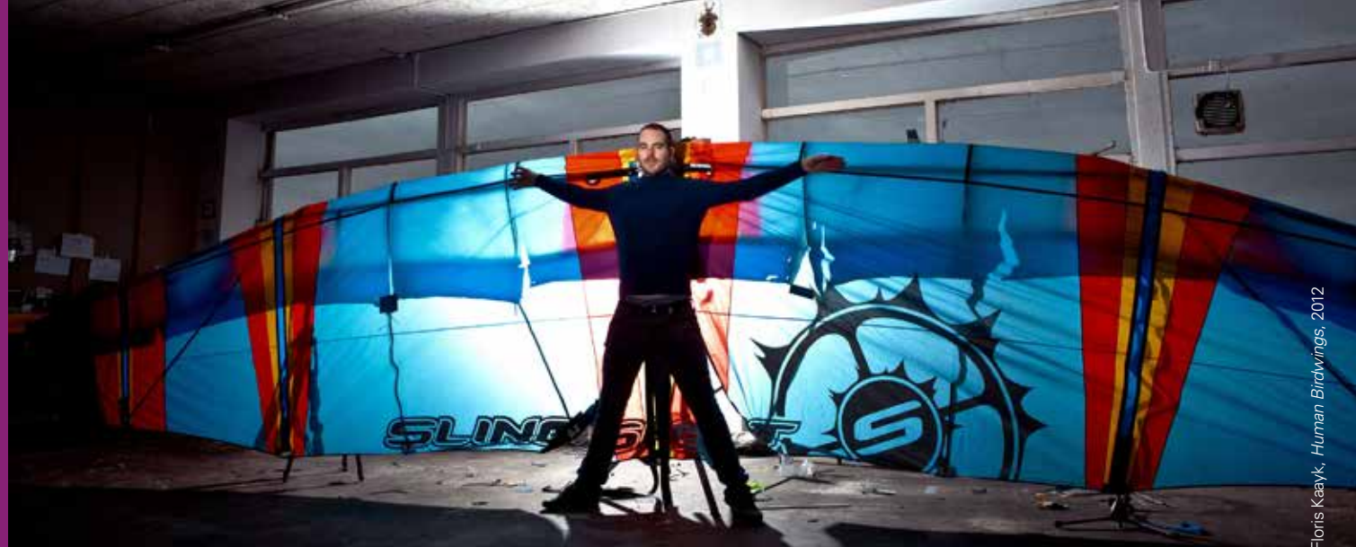
Floris Kaayk, Human Birdwings, 2012