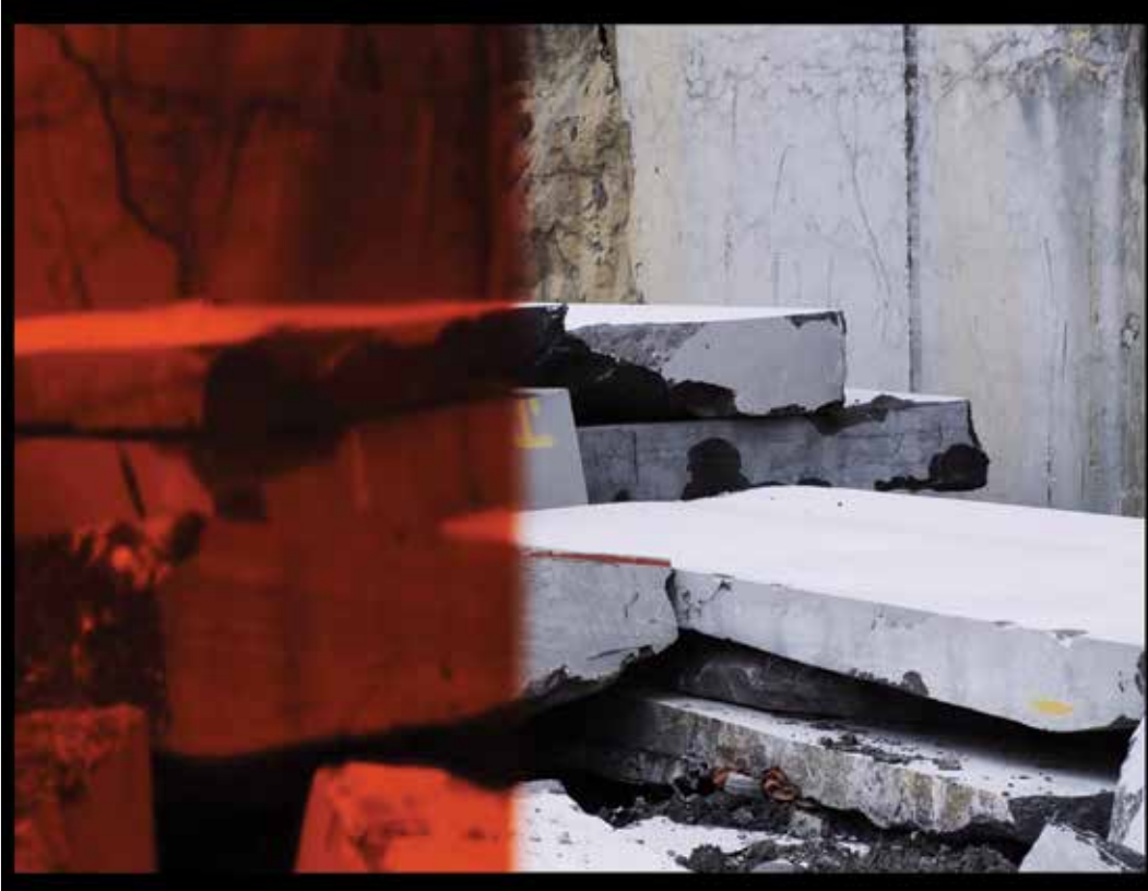
Niamh O'Malley, Quarry , 2011.

visit www.thebluecoat.org.uk or telephone 0151 702 5324