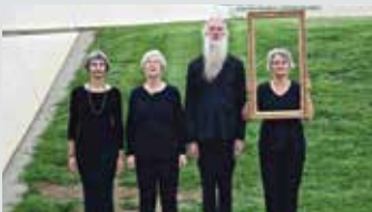
The GOLD Company.