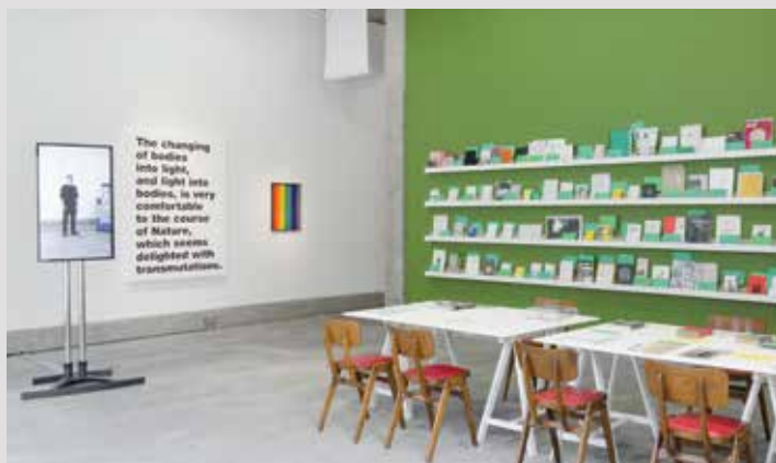
RESOURCE installation view at Bluecoat, 2015.