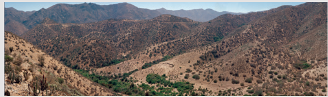
El Mauro, Latin America's largest toxic dump from the series Antofagasta plc, stop abuses! . Province of Coquimbo, Chile. C-Type Print 100x240 cm. Edition of 5. Ignacio Acosta (2014)